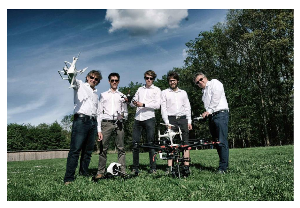
The team of the Luftprofile GmbH

In addition, Luftprofile GmbH is a training centre recognised by the Luftfahrt-Bundesamt according to §21 d LuftVO and issues the commercial drone driver's licence or proof of knowledge in Hamburg and throughout Germany. This means for customers: UAV pilots with a UAV driving licence and years of flying experience, as well as flight planning, approval procedures and flight execution from a single source. Depending on requirements, the company puts together an experienced team for post-production and data analysis of projects. (Source: <a href="https://www.luftprofile.de">www.luftprofile.de</a>)